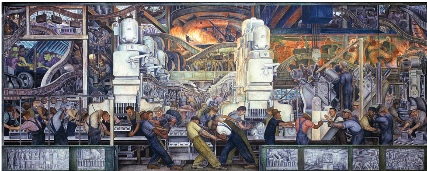
Fig. 1. Diego Rivera's mural of factory workers at Ford's River Rouge assembly plant (detail). Modern economies require cooperation toward common ends among countless individuals, often occurring as the result of both self-interested and

The other treatment precluded communication but simulated “government regulation.” Withdrawals were not to exceed the announced